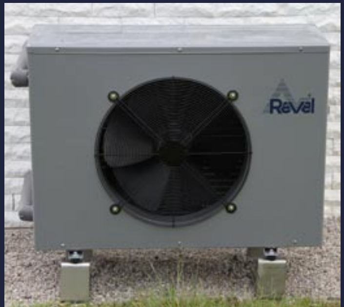
LWRc-8kW - heating, cooling, in-built boiler